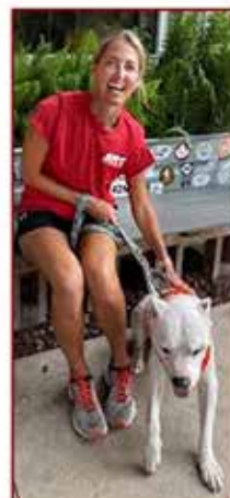
Ft Myers Brewing Co.