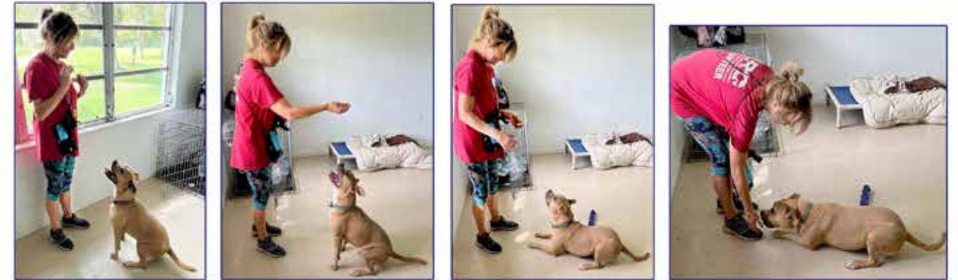
Kota learning the basics of sit, stay, and down