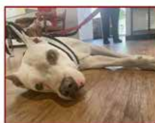
Woof Walk's Zero

Lee County Sheriff's Office Miromar Outlets