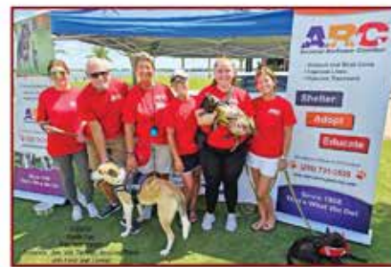
Babcock Ranch Earth Day