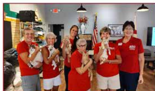
Pizza & Paws at Miromar