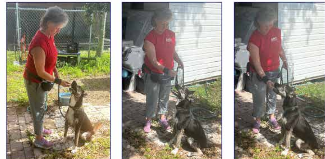
Boomerang learning to focus outdoors