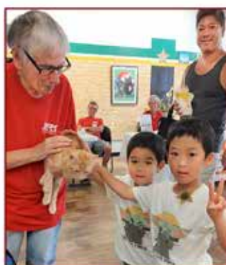
Making new friends at Pizza & Paws