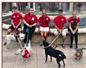
Woof Walk at Lee County Sheriff Office