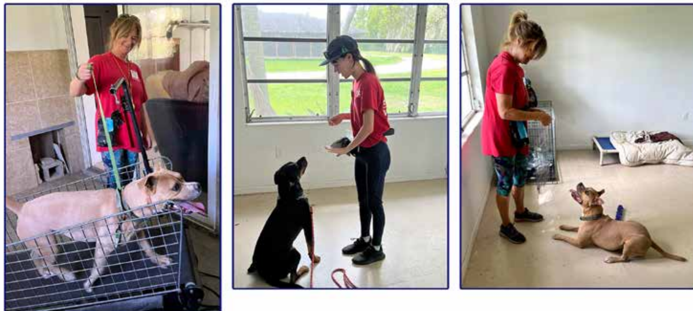
Kota learns the treadmill!

As can be seen by the accompanying pictures, the Dog Adaptability Program, in addition to addressing the behavioral traits, is also fun and stimulating for both the dogs and the DAP Trainers as well as enjoyable enrichment for animals who could really use it. Everything that we can do to help get those safe and happy homes for our dogs is more than worthwhile ... it is our mission.