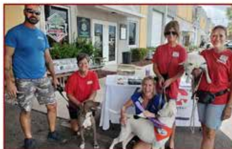
Ft Myers Brewing Co.

Putting our best paws forward, ARC volunteers continue to meet and greet the public showing dog and cats available for adoption. We are so thankful for invitations to attend communities or places of business to share heartwarming stories of rescue and rehabilitation. The final step of all that hard, but full-filling work, is to find more ARC dogs and cats a home that is the perfect fit for them! So, keep those invitations coming because we love making new friends and our dogs and cats love getting out and about!