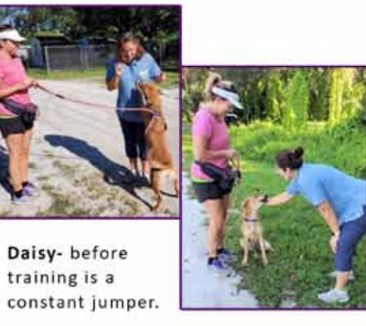
Training results in a wellmannered greeting.