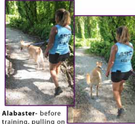
training, pulling on leash.