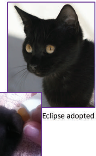
Eclipse as a bottle baby