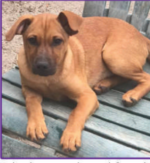
Ashe born male and female converted to female