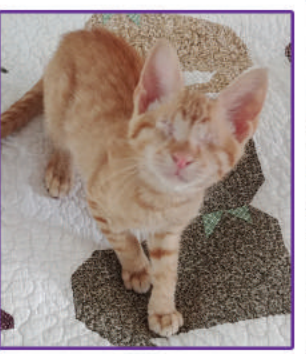
Tuscan sees by hearing