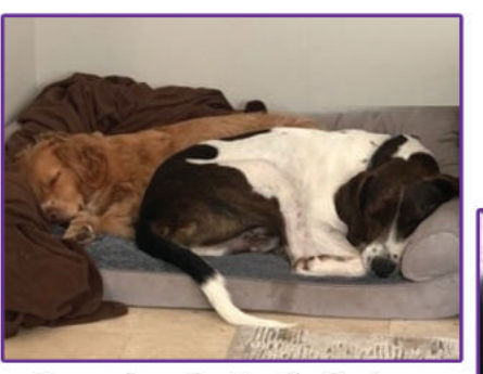
Gump, from feral to family dog