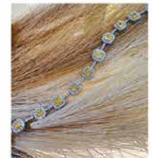
Dunkin Diamond's Fire and Ice