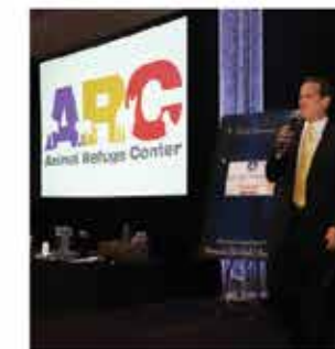
Let the Bidding Begin!